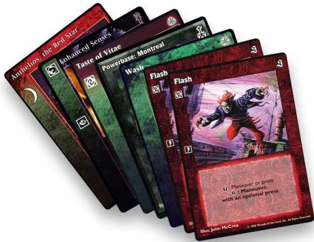
Hand (7 cards, replace played cards immediately)