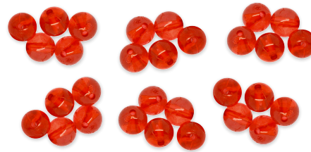
Pool (start with 30, dead when 0)