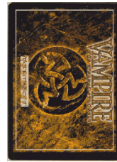
Crypt (12+ cards)