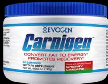
CARNIGEN by EVOGEN