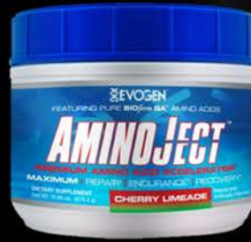
AMINOJECT by EVOGEN