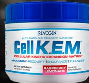
CELL KEM by EVOGEN

www.evogennutrition.com use code: 15offJB for 15% your entire order