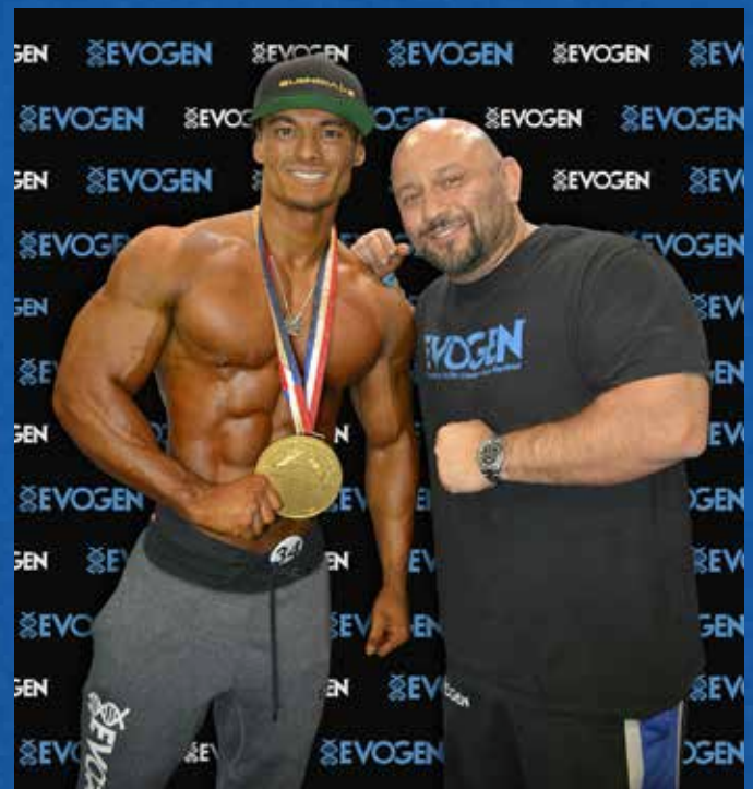
2X Physique Olympia Champion JEREMY BUENDIA with COACH HANY RAMBOD at the 2015 Olympia Weekend in Las Vegas

and is known for his dramatic shoulder-to-waist ratio with razor-sharp definition. Originally a bodybuilder, Buendia transitioned into Men's Physique in 2012. He began taking the class by storm and has never looked back. As Evogen Nutrition's premier athlete, Buendia exemplifies not only true grit and dedication, but also serves as the best example of what FST-7 and Evogen Nutrition supplementation can achieve.